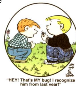
“HEY! That’s MY bug! I recognize him from last year!”

With intent and sustained determination, these wounds can be healed -- but it won’t be easy. Amidst American society’s current obsessions with electronic entertainment, relentless school testing, and 100% safety at all times, mindful parents and caregivers will need to take a strong, pro-active stand in order to restore their children’s connections to nearby nature – and the sense of place that those experiences engender. Virtually without doubt, though, in 50 years’ time those parents’ lucky children will recall their childhood realms with knowledge and affection, and with no remorse for the video gaming they missed out on!