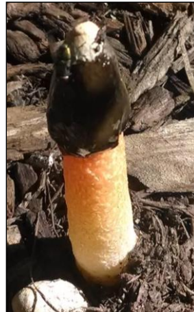
The Elegant stinkhorn fungus

The underlying lesson is simple, really: nature is always there. No, make that “nature is always here .” It is easy to slip into thinking that “nature” is only a far destination, usually featuring gorgeous beaches, raging waterfalls, enticing forests, and towering mountains. These are the images of nature that travel brochures and tourism websites lure and delight us with.