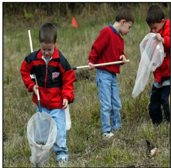
Young scientists at work? You bet!

Years later, these first-hand experiences will resonate in science classes, as their minds consciously or subconsciously connect real, observed phenomena with textbook lessons. Just as importantly, these same experiences will forever be embedded in their personal sense of place. Their self-identity will be at least partially defined by the land they explored and the nature they found during their youth. A logical extension of this is that they will gain a greater concern for the natural world, since we all tend to care about – and care for – those things we know and love.